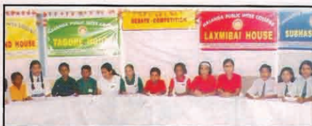
INTER HOUSE DEBATE-COMPETITION