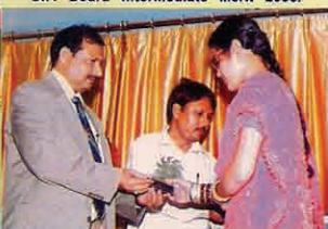
Ad. Commissioner Lko. rewarding intermediate girl for good academic performance.