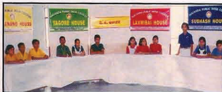
INTER HOUSE G.K. QUIZE