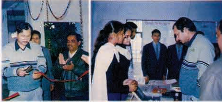
DIOS Lko. IN SCIENCE EXHIBITION

In modern time students have to face tough competitions on each step of progress in life so different internal competitions are organised at inter-house, interbranch level with a motive to prepare students to appear & face in external