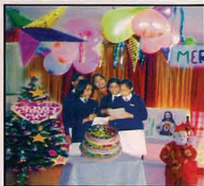
CHILDREN WITH SANTA ON X-Mas.

& play ground for primary, provide the Kids a Paradise where they ensure their mental & physical soundness.