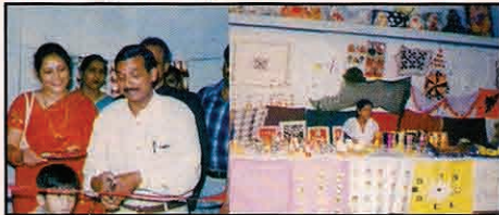
ADIOS Lko. INAUGURATING ART & CRAFT EXHIBITION

competitions done at district, state & national level in various fields of knowledge like, debate, quiz, art & craft, essay, writing, science exhibition, G.K., N.T.S.E. and other engineering, medical, airforce & naval competitions. As a result many students of school got success in these and are also awarded by Secretary, D.M. & Commissioner.