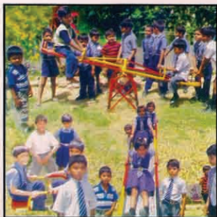
NURSERY GARDEN & PLAY- GROUND FOR PRIMARY