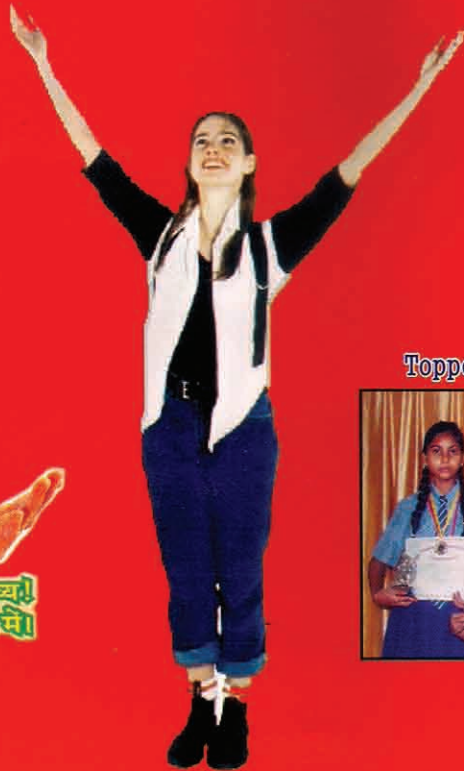
Toppers with Director Mam