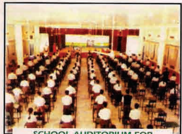
SCHOOL AUDITORIUM FOR STUDENT'S CULTURAL ACTIVITIES

Different type of cultural activities are organised on house level & school level, time to time and